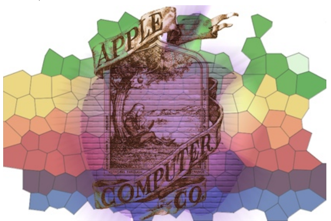
About This Particular Macintosh: About the personal computing experience.<sup>™</sup>