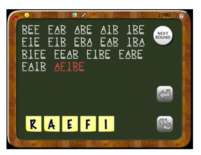
Individual Retirement Account or Irish Republican Army?

WordSoup is probably geared toward little kids as the game interface is basically a green chalk board. You are given letters on yellow sticky notes with which you form words, three letters or longer. Words are formed by dragging the letters onto a line above them, then clicking the icon for the Enter key. Acceptable words would appear in the possible word list. If the word is not acceptable it just sits there and nothing happens, no error-sounding noise whatsoever. Decent typists can just type them and press Enter. The letters can be scrambled to help you form words that you may miss. You earn points for the words you find. To advance to the next level, you must form the longest word possible with the given letters, which is called the mystery word. When you lose, if your score is higher than the preset top ten, you get to add your name to the High Score list.