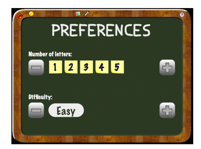
I could really use a mute checkbox.

There is little to tinker with in the Preferences panel as well. You can increase the number of letters thereby making the mystery word harder to guess. You can also choose a difficulty level: Easy, Normal, or Hard. The only difference between the levels is the amount of time allowed. I think it is perfectly fine to have that little control over the game. However, I really wish there were a mute option for the annoying sound of chalk scraping. Sure, I can mute systemwide, but I do not want to miss out on alert sounds for new e-mail or a low laptop battery.