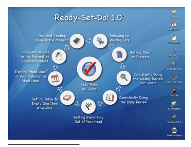
<sup>14</sup>http://www.omnigroup.com/applications/omnifocus/ <sup>15</sup>http://homepage.mac.com/toddvasquez/Ready-Set-Do!/ Personal93.html

Developer: Todd Vasquez Current Version: 1.3f Price: $20 Development Status: Release iCal Sync: Yes QuickSilver Plug-in: Yes Web-app Sync: No Print Lists: Yes iPhone Presence: None Required Applications: None